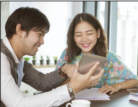
Become a tutor.