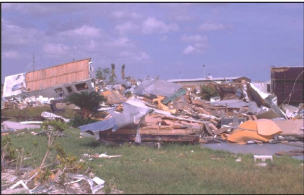
Help communities with storm clean-up.