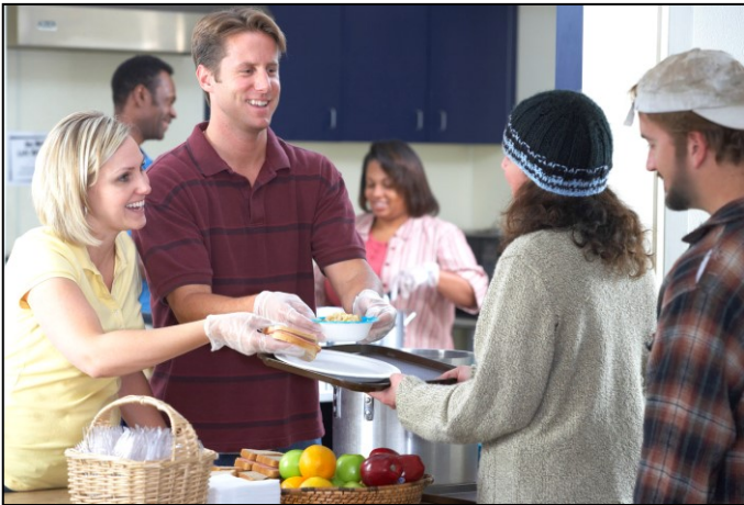
Serve or prepare meals at homeless shelters.