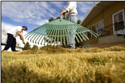
Help with city or school beautification projects.