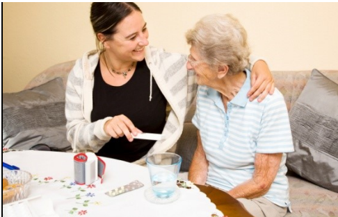
Assist the elderly at senior citizen centers.